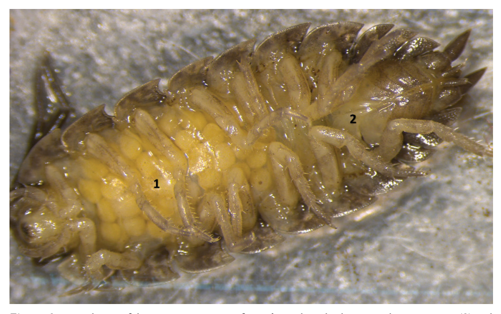
Figure 1. Ventral view of the intersex specimen of P. scaber with multiple eggs in the marsupium (1) and a male pleon (2).